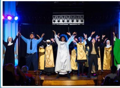
Choir School and Serviam Girls Academy, Summer musical program (2021 Small)

Lifetime Commitment since 2008 $33,125,005