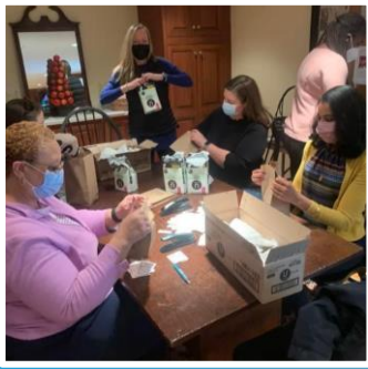
Junior League of Wilmington, Feminine Hygiene program (2021 Small)