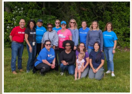
Highmark Delaware BluePrints funded the United Way Born Learning trail at Glasgow Park. Highmark DE team members volunteered to replace signage and paint the trail.