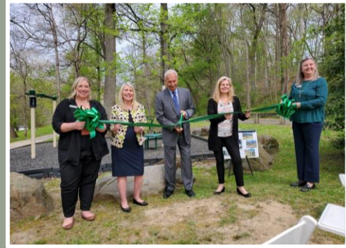
Friends of Brandywine park, Fitness Stations project (2020 Small, ribbon cutting 2022)