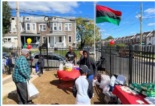
Cultural Restoration Project, Sankofa Healing Space project (2020 SDOH, completed 2022)