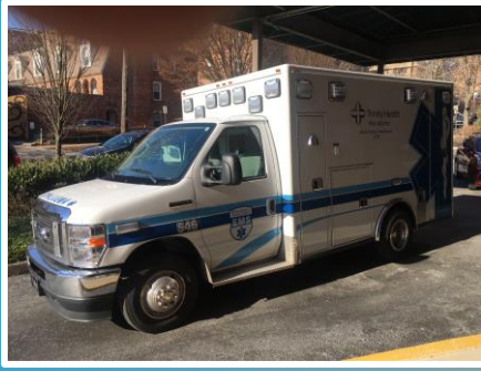
Saint Francis, New Ambulance (2021 Standard)