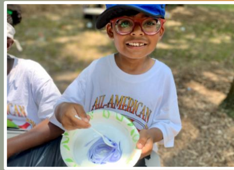
Nehemiah Gateway, Tennis Rocks summer program (2020 Small)