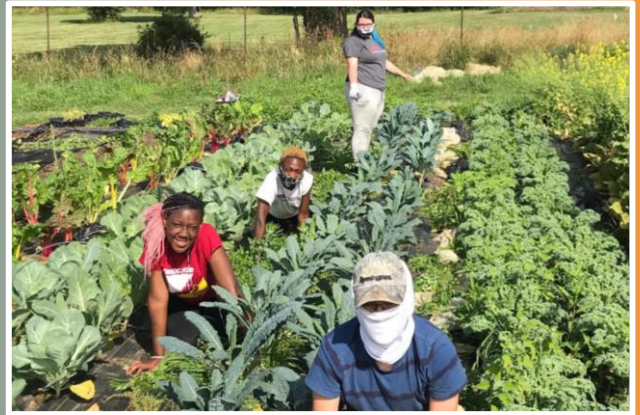
West End Neighborhood House, Bright Spot Farms (2020 Small)