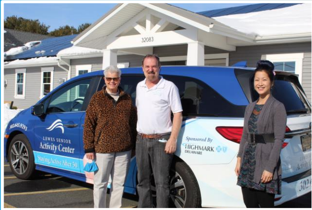
Lewes Senior Activity Center, Health Transportation (2021 Small)